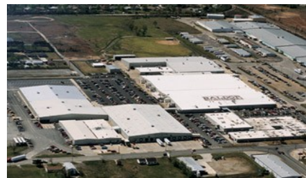
Aerial view of the Baldor flagship facility in Fort Smith