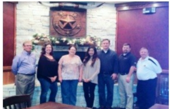
APICS NWA Chapter Board Members (not all pictured)

For inquiries regarding this Newsletter, please email programs@apicsnwa.org .